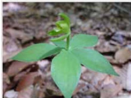
All orchids require fungi at some point in their lives, but the small-whorled pogonia requires it always. It is a parasite on the fungus, which itself has a symbiotic relationship with certain trees. Thus, in a sense the pogonia is a parasite on both the fungus and the tree.

The small-whorled pogonia has a single grayish-green stem that grows about 10 inches tall when in flower and about 14 inches when bearing fruit. The plant is named for the whorl of five or six leaves near the top of the stem and beneath the