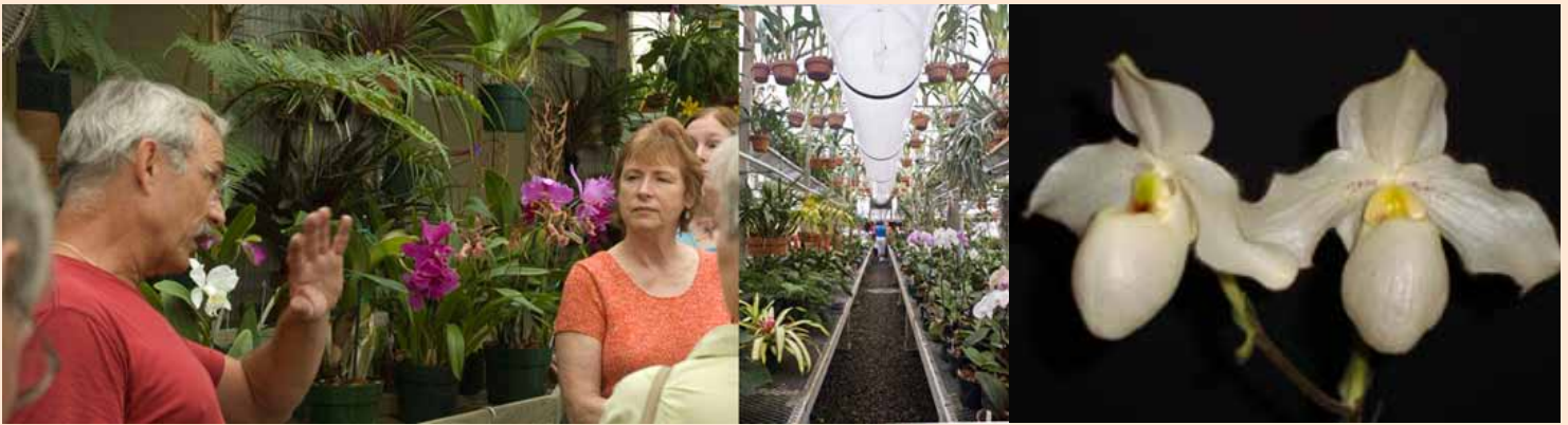
Photos from the 2009 open house