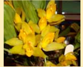
Lyc. aromatica, Cy Swett's first place fragrance class win on the June show table.