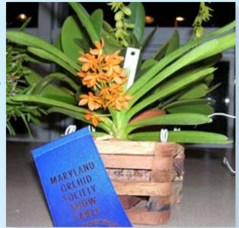
Asctm. ( garayi X ampullaceum)