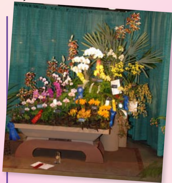
The Little Greenhouse display from the 2006 show.