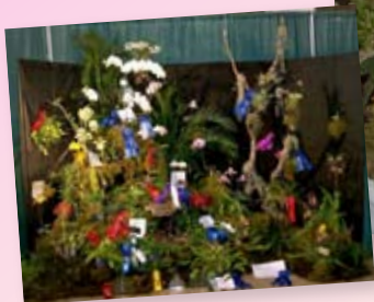
Rachael and Steve Adams' display from the 2006 show.