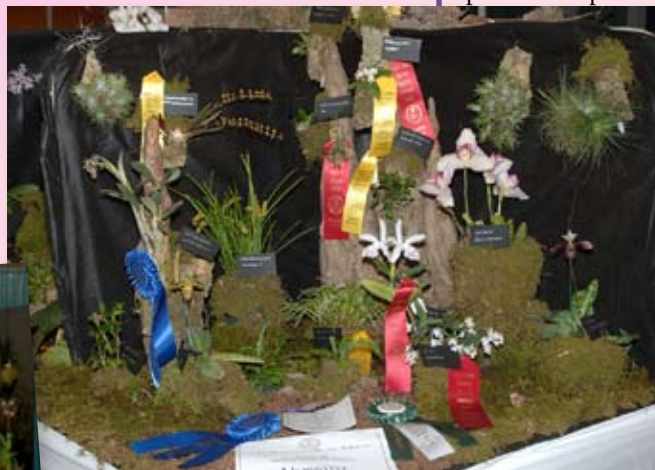
David Smith's table top display won the Best Table Top Display Award last year.

Look for the volunteer sign up sheets at the February meeting and plan on helping; you'll be glad you did.