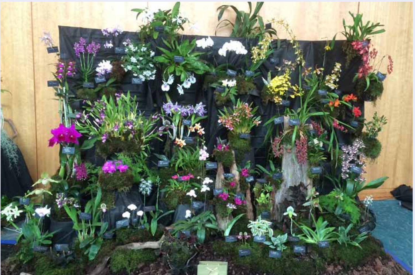
Maryland Orchid Society installed the Best Society Exhibit and won the Orchid Digest Trophy for the Best Amateur Exhibit in the show.