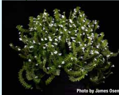
October blooming which received the CCE/AOS in October, 2012

In my greenhouse, it has always received bright light with some direct sun during the winter after the shade compound on the glass has been removed by summer and fall rainfall, or by me. I do not allow it to dry out because the basket allows perfect drainage. During the winter months, November through February, it is grown at intermediate temperatures with a minimum nighttime temperature of about 58-60 degrees. I try to limit the maximum summer temperature to about 84-86 degrees through the use of an evaporative cooler, misting, periodic spraying to simulate rainfall, and shading on the glass. It hangs about six feet from the floor where it receives good air movement because the greenhouse is completely open during the summer to allow as much air movement as possible to help with the cooling. As a result of the watering for