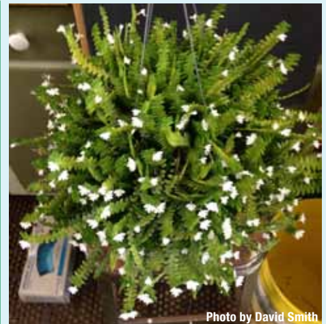
November, 2013 blooming of Angraecum distichum 'Aubert Wines' CCE/AOS

This plant might prove to be a big challenge for growing on a windowsill, but would possibly be worth trying in a more