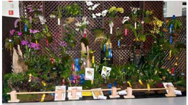
MOS exhibit for the 2011 NCOS Show.