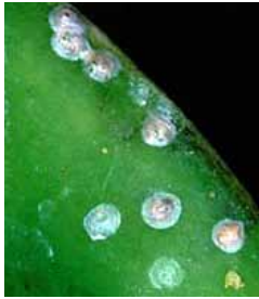
South Dakota State University