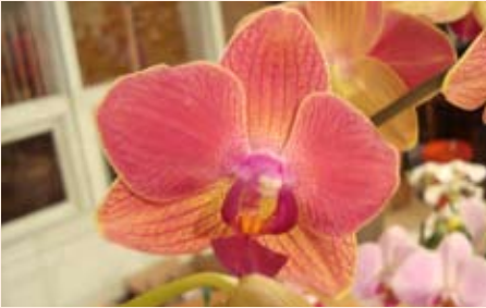
Phal. Orange Love - Lynn Pastore