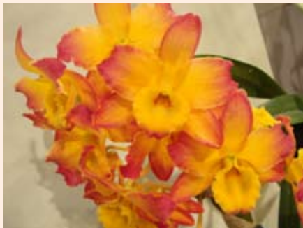
Den. Oriental Smile 'Fantasy' - The Adamses