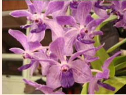
Rhv. Blue Lightning - Les Kirkegaard