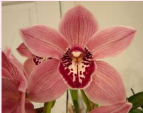
Cym. Red Beauty 'Carmen' - Cy Swett

Plants should be putting on a spectacular show this time of year. Adjust all staking and twist-ties and be on the lookout for aphids, slugs and snails. Give adequate water because flowering strains the plants. As new growths appear later, increase the nitrogen level in the fertilizer. Should a plant look healthy but not be blooming, try increasing the light during the next growing season. The number-one reason for no flowers is lack of light.