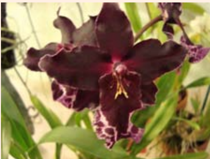
Vuyl. Melissa Brianne 'Shady Lady' AM/AOS