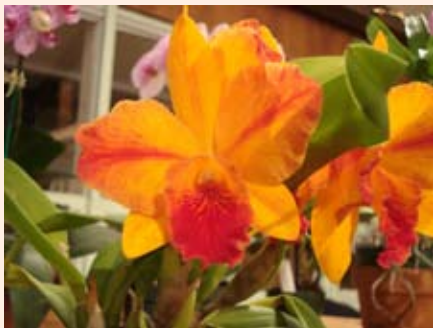
Slc. Hazel Boyd - Gregg Custis