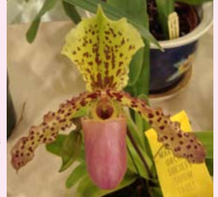
Paph. Diane Vickery - Cy Swett

These hard-cane dendrobiums will be at their flowering peak now. It is not unusual to see a specimen of this type in an orchid show boasting 1,000 flowers. The secret with this group — bred primarily from Dendrobium kingianum and Dendrobium speciosum — is to provide ample water, fertilizer and light during the growing season.